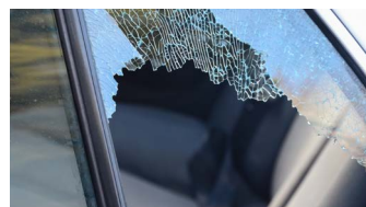
Glass Break Detector