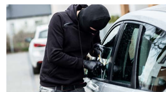
Car Alarm Detector