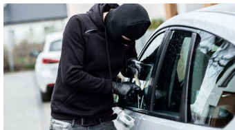
Car Alarm Detector