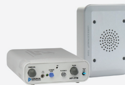
ASK-4® kit #501